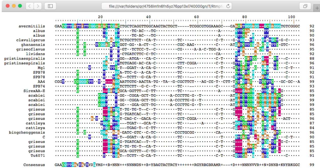
Figure 2: Amplicon with the target site for each primer colored

> BrowseSeqs(amplicon, colorPatterns=c(4, 27, 76, 94), highlight=1)